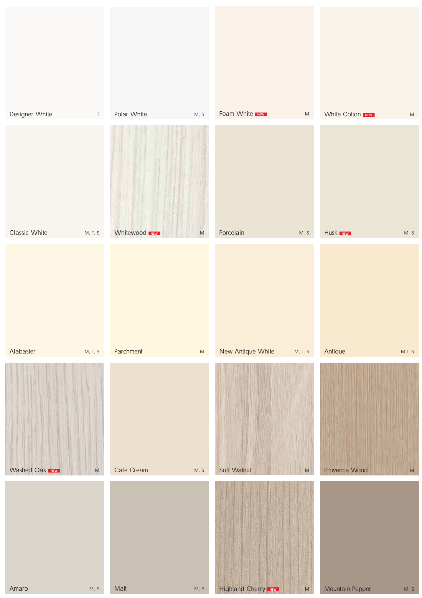
Available finishes M = Matt T = Texture S = Sheen