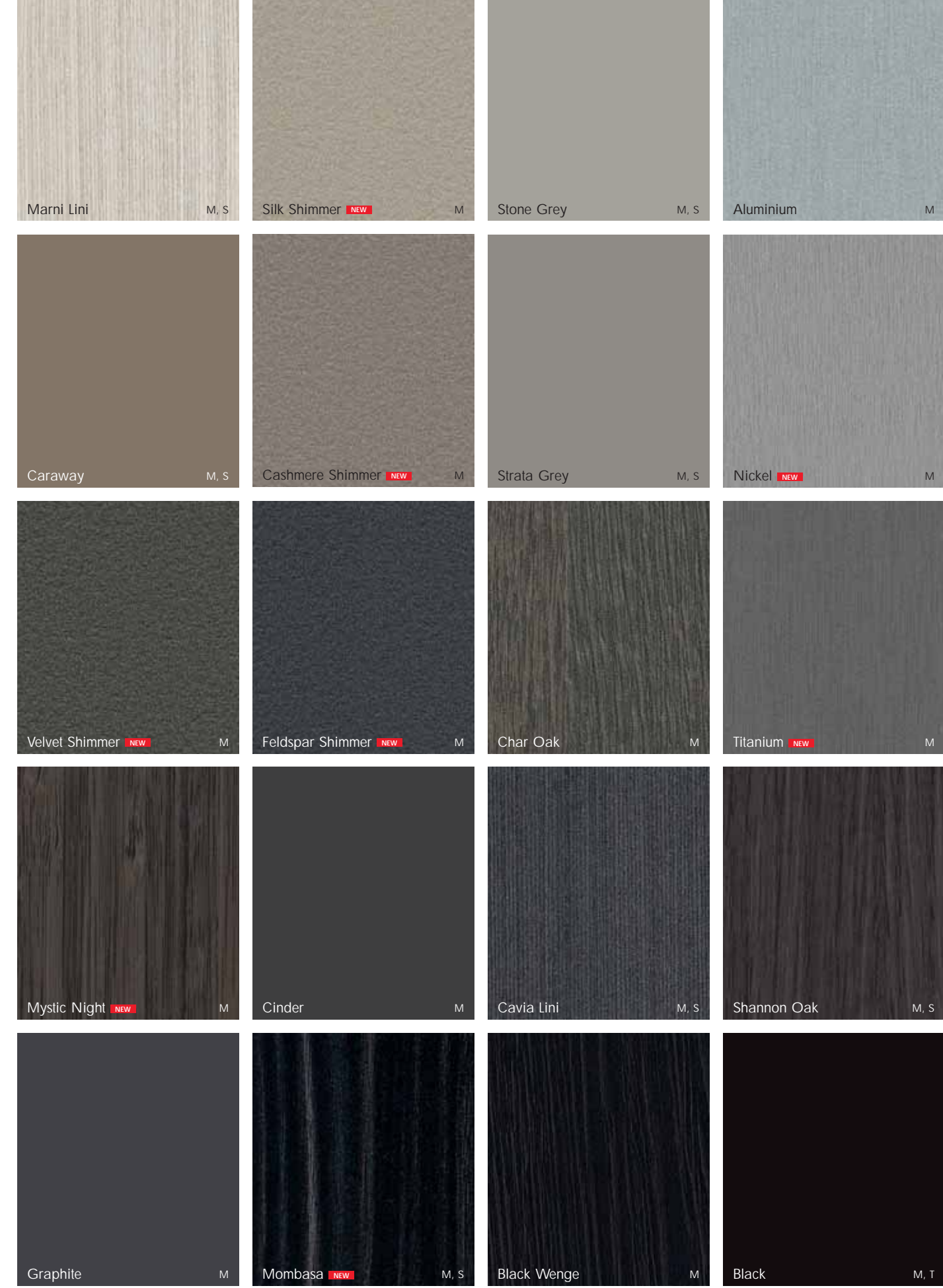
Available finishes M = Matt S = Sheen10