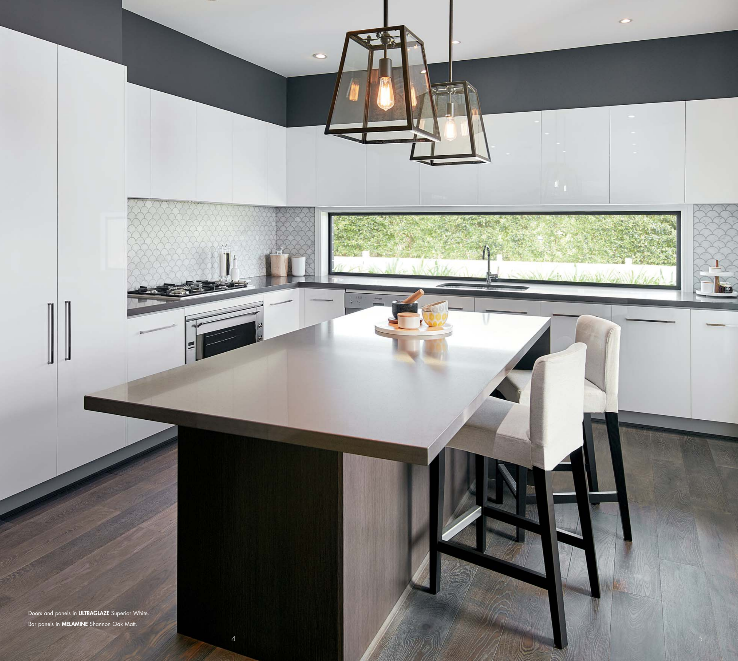
Doors and panels in ULTRAGLAZE Superior White. Bar panels in MELAMINE Shannon Oak Matt.